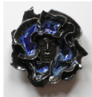
The 2016 Mala Project will present Lotuses and the Buddha.

The 2015 Art Show & Sale was the best attended ever. Proceeds from the Sale allowed the Fund to benefit 14 organizations and 10 food pantries with grants from $250 to $1000.