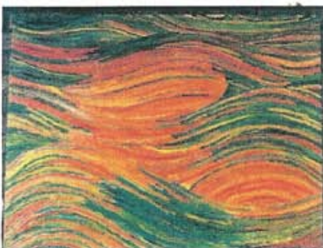
"Fields of Gold" by Lynne Bode Oil over mixed media 30" x 40"

Proceeds from the sale of art benefit The Will Flores Fund. (See page 2.)