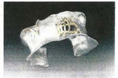
"Caged Birds Don't Sing"...Sterling Silver & 14K cuff by metals artist Noël Leicht

Papers were filed in mid July to apply for federal tax-exempt status. She said it usually takes three months for the Internal Revenue Service to approve applications.